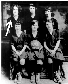
Meriden High School